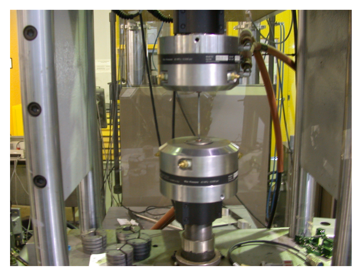
Figure 1 shows the test setup. Wire is gripped between the upper and lower grips. The upper grip is fixed while the bottom grip rotates.